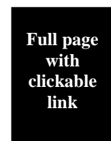
18.4 cm x 15.3 cm $250

Prices quoted are per month. GST not included.