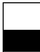
15.3 cm x 9.2 cm $80